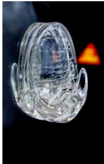
Make bonding invisible!