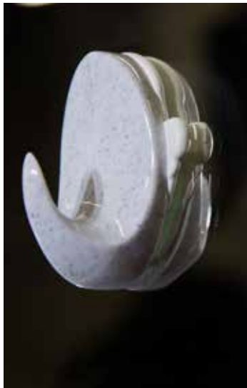
A visible adhesive is ugly.